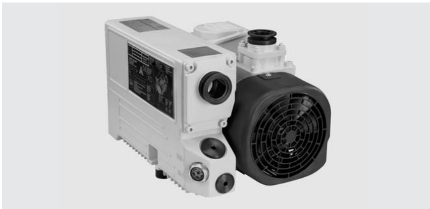
SOGEVAC SV 40 BI