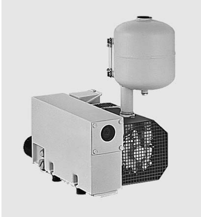
SOGEVAC SV 40 with SL 40 liquid trap

The SL 16-25 liquid trap consists of a collection vessel made of transparent plastic.