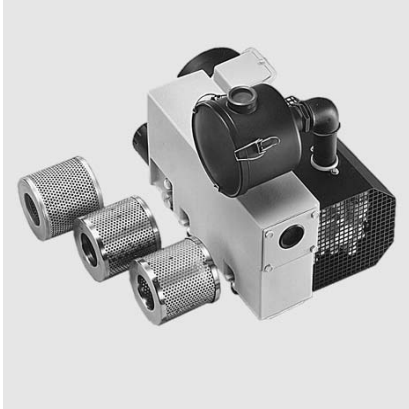
SOGEVAC SV 40 with connected F-100 dust filter and different types of filter cartridges

High efficiency F filters are recommended for use at the inlet of SOGEVAC rotary vane vacuum pumps for protection against process contaminants, e.g., fiberglass particles, plastic dusts, resins and food-processing by-products. The filters are available with easily replaceable cartridge elements for particle filtration of dusts and particulates down to one microns, or activated carbon elements for the adsorption of chemical vapor.