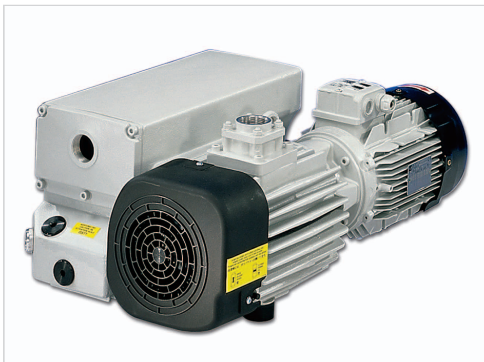
SOGEVAC SV100 B