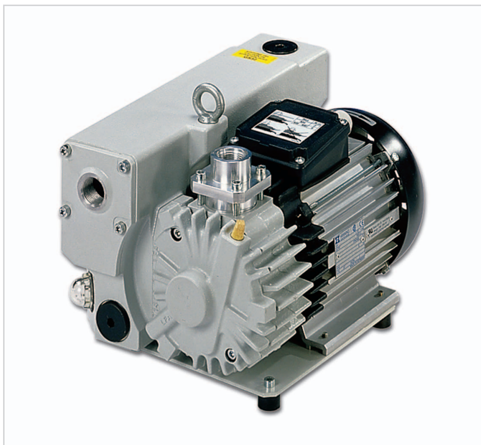
SOGEVAC SV25 B