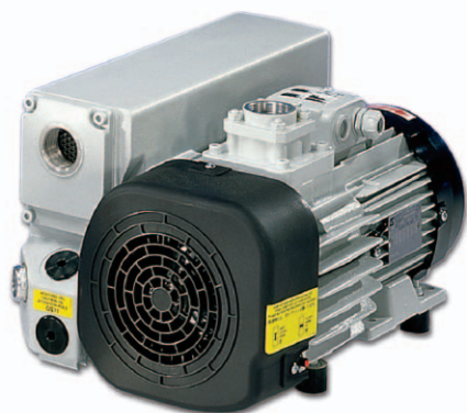
SOGEVAC SV40 B

All this without any concession to the high technical performance of the SOGEVAC pumps such as ultimate pressure, pump-down time, water vapor tolerance, etc.